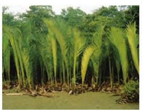
Palm Basket Bag Tray Laundry Storage Toy Box Card