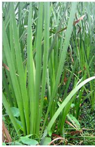
Seagrass (Hogla) Product Bag Basket Laundry Storages Tray Box Plate Etc.