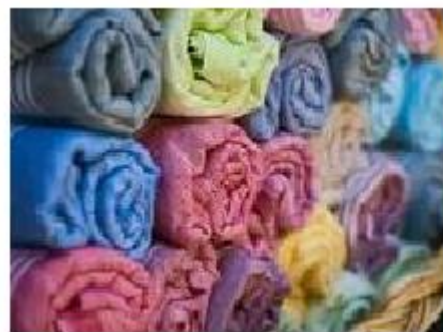
Fabric Product Bag Storages Laundry Gifts Item Etc.