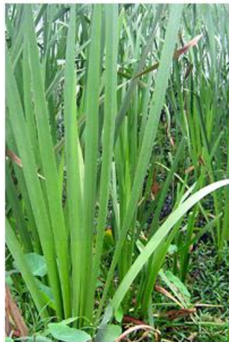
Seagrass (Hogla) Product Bag Basket Laundry